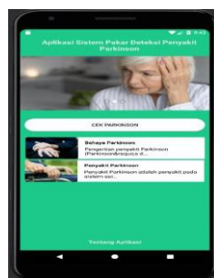
Figure 4. Home Page

The following is a view of the home page of application users that can be accessed through the mobile app.