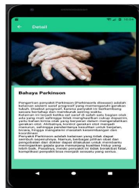
Figure 6. Performing Information Search Page

On the information search page is a page that displays Parkinson's-related information in the form of reading articles that can be read by the public.